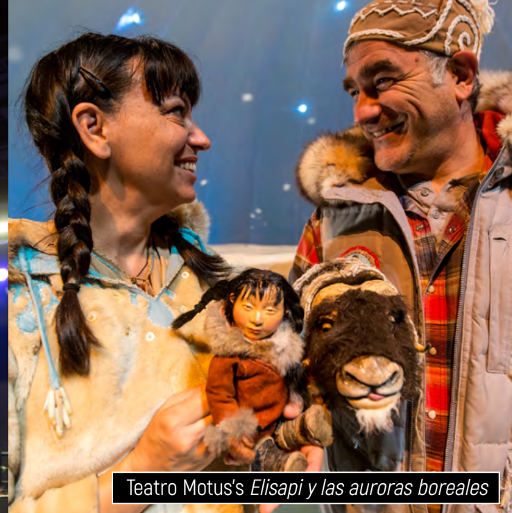
Teatro Motus's Elisapi y las auroras boreales