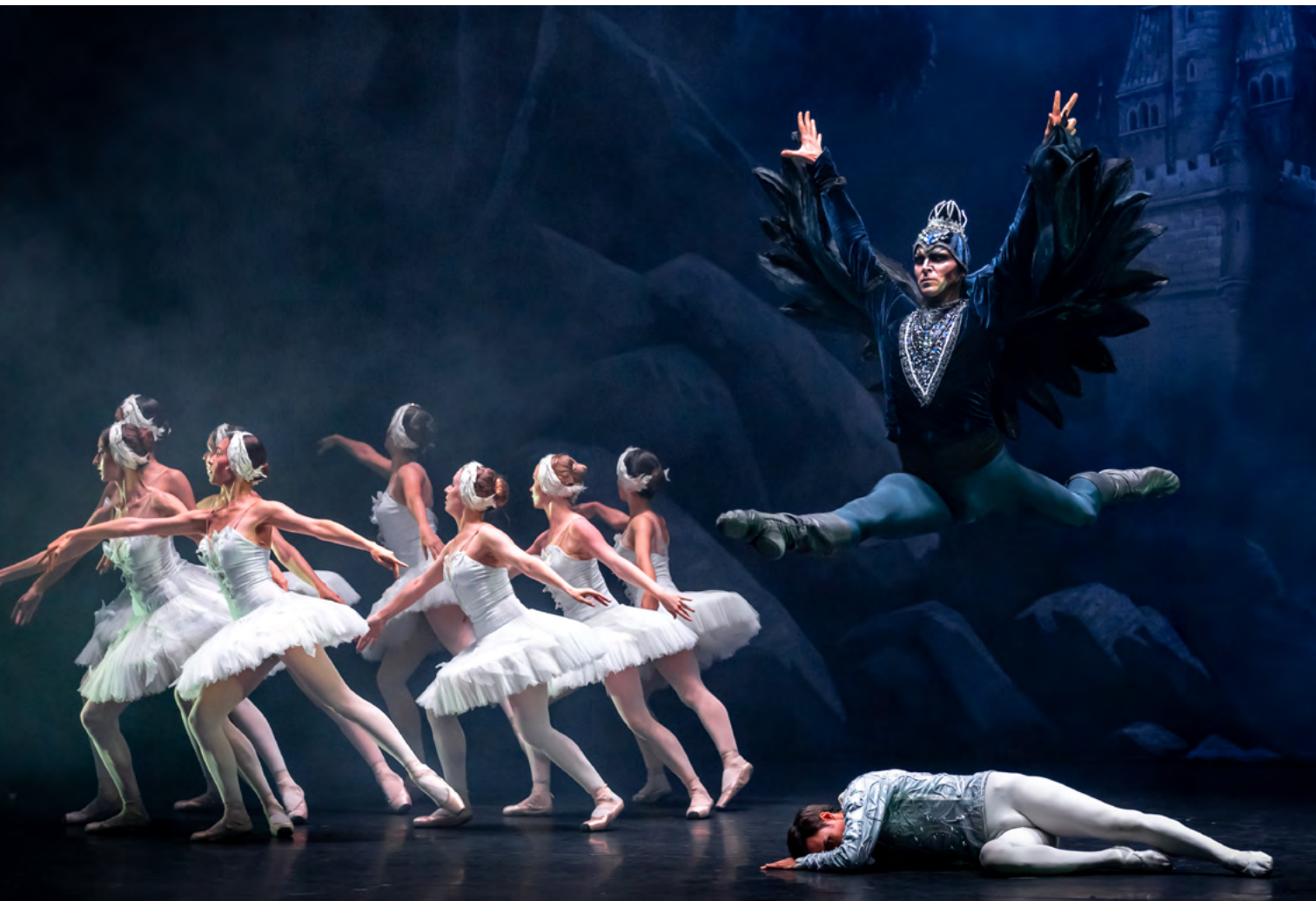
Lago de los Cisnes